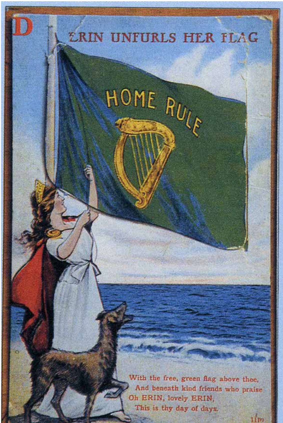
A pro-Home Rule postcard depicting Ireland as woman campaigning for Home Rule. On display at Mid-Antrim Museum - on loan from Linen Hall Library